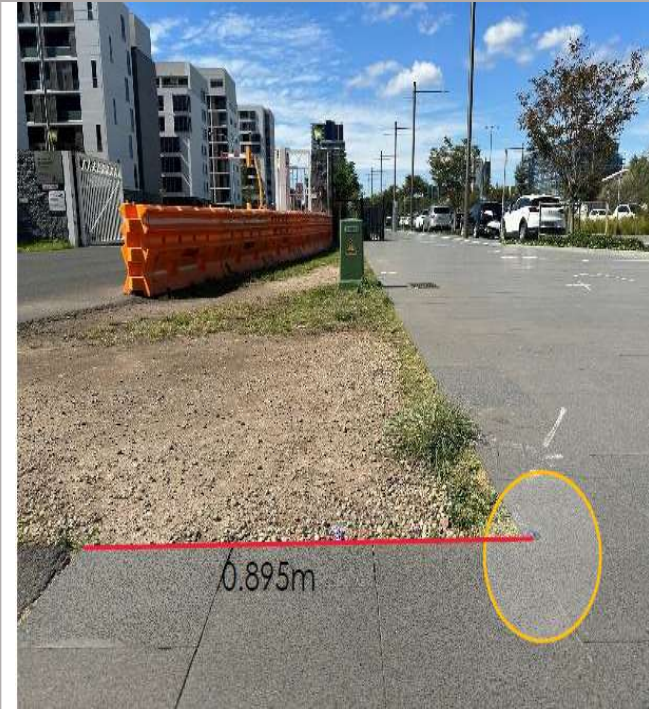
Facing east from Joynton Avenue Land shown at the narrowest width Zetland Avenue to right